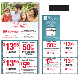
11 x 5.5 Magnet Postcard

Minimum print quantity of 5,000 (1 or 2 coupon offers with perforation)