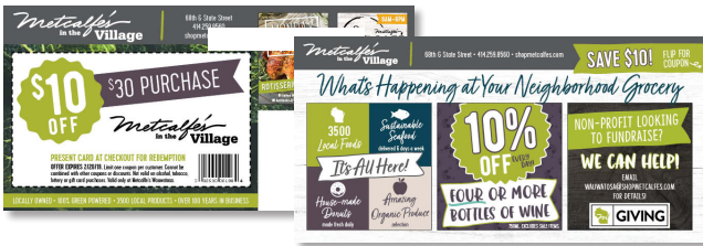
5.5 x 11 Custom

Minimum print quantity of 5,000 (Up to 4 coupon offers)