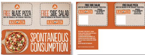
4.25 x 5.652 Laminated Postcard

Minimum print quantity of 5,000 (Up to 4 coupon offers)